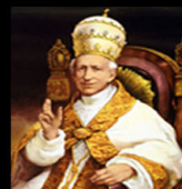
Pope Leo XIII

FREE ADMISSION Donations Greatly Appreciated!