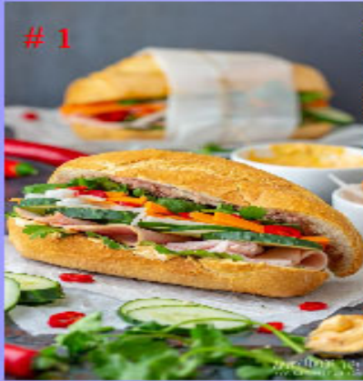
Bánh Mì - Combo + Water

Please help buy and promote this Banh Mi sale so we can raise some fund to buy a piano for the church. Thank you so very much for your support.