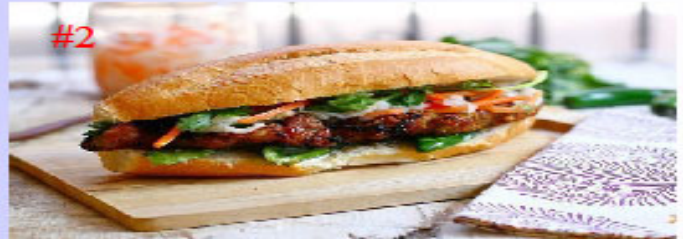
Bánh Mì –Grilled Pork + Water