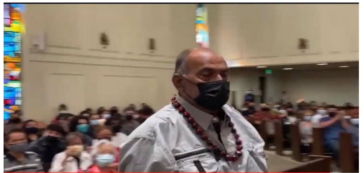
8/22/21 Sunday 10:00 AM Mass