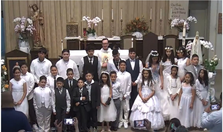
Mother's Day Blessing to all Mothers