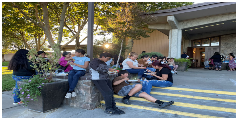
Hispanic Youth Group Gathering

Jóvenes de edades entre 13 y 25 años están cordialmente invitados a participar de las reuniones que tenemos todos los Miércoles de 6:00 pm a 8:00pm. En el salón parroquial animate tenemos muchas actividades divertidas y al mismo tiempo aprenderás a reforzar más tu fe.