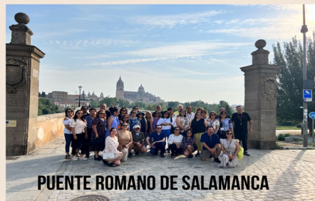
PUENTE ROMANO DE SALAMANCA