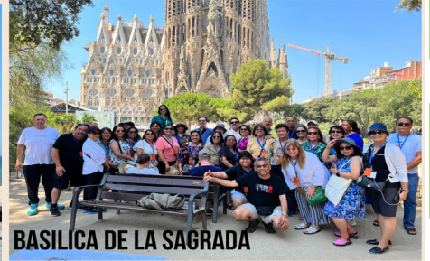
BASILICA DE LA SAGRADA FAMILIA, BARCELONA