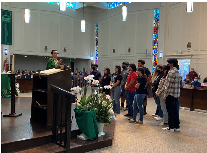
Peer Leaders Blessings last Sunday at 10am

MEXICAN ITALIAN NIGERIAN AMERICAN FILIPINO TONGAN