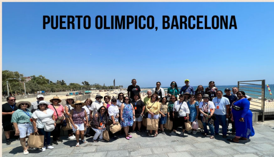
PUERTO OLIMPICO, BARCELONA