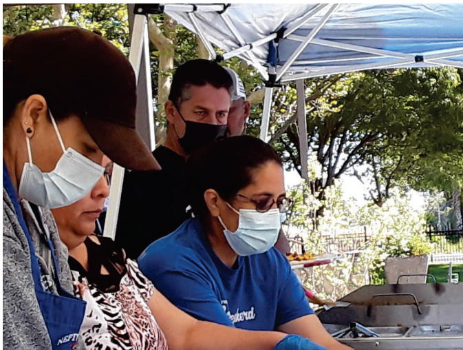
Spanish Community working together to raise money for the Guadalupe Feast Day.