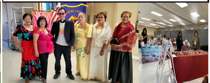
The Beauty and the Priest (Holiday craft faire fashion show)

All Young Adults from 21yrs to 35yrs are invited to join our Young Adult ministry. The kick off day will be November 9 at 7pm in the ministry building. If you are interested, just show up on that day.