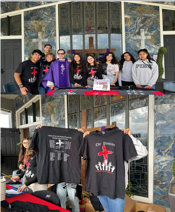
Purchase the Passion Play T-Shirt to support our Youth Ministry. $20 each