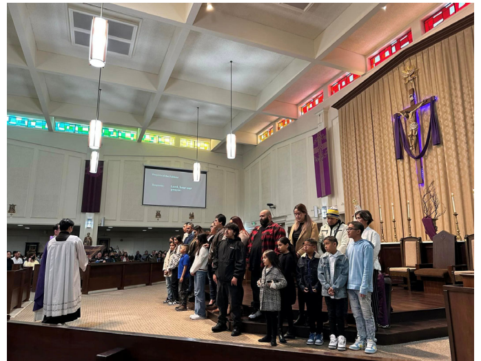
First Elect Scrutiny Candidates blessing March 12, 2023 - Third Sunday of Lent.