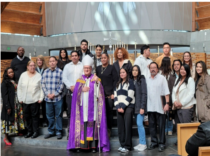
Rite of Election for our catechumens and candidates on Feb 25 at the Diocese