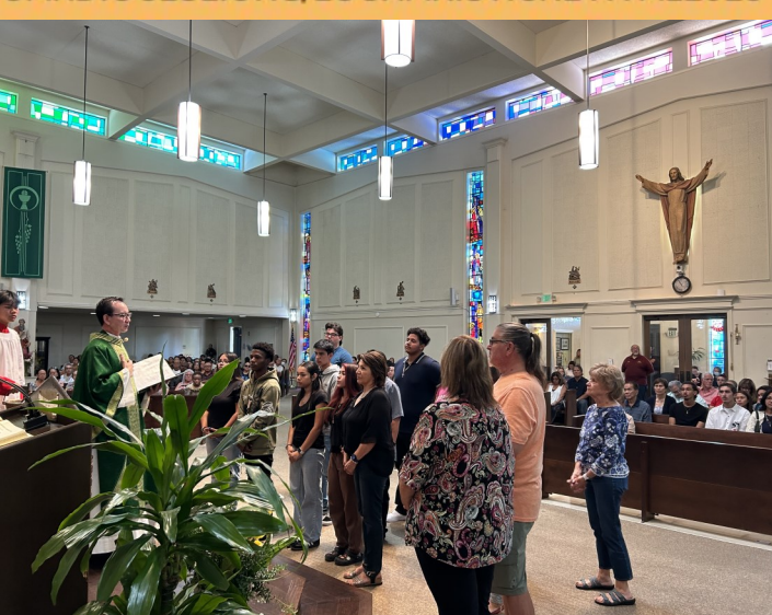
Peer Leaders training workshop, 8/20/23