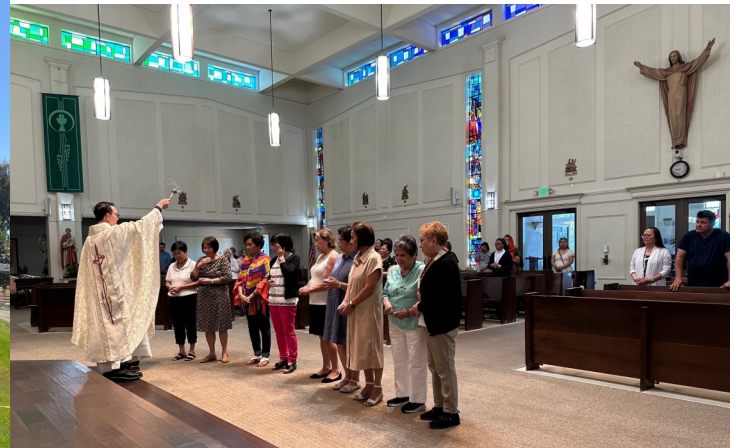
Blessings for members of the St. Martha's Guild, as they celebrated their Feast Day on July 29.