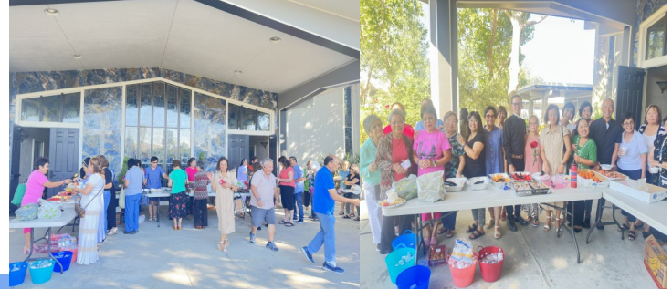
St. Martha's Feast Day reception