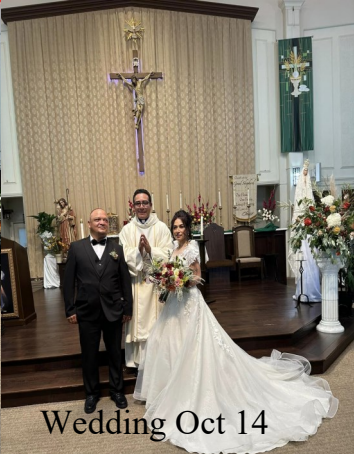
Wedding Oct 14