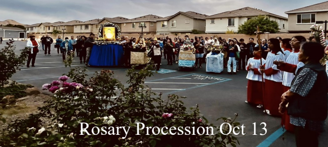
Rosary Procession Oct 13