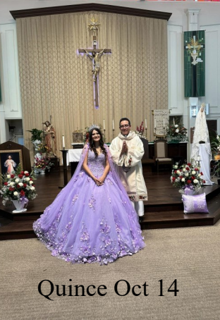
Quince Oct 14