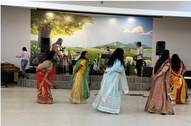
Pakistani dancing ladies