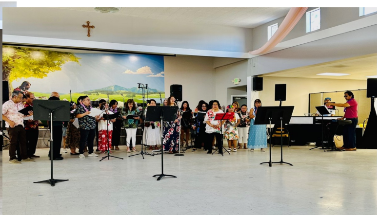
8am Mass and 12pm Mass Choir