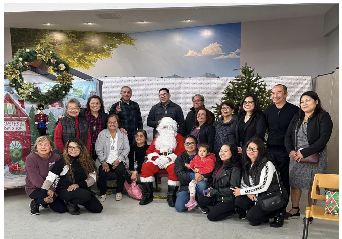
Parish Breakfast with Santa, December 3rd