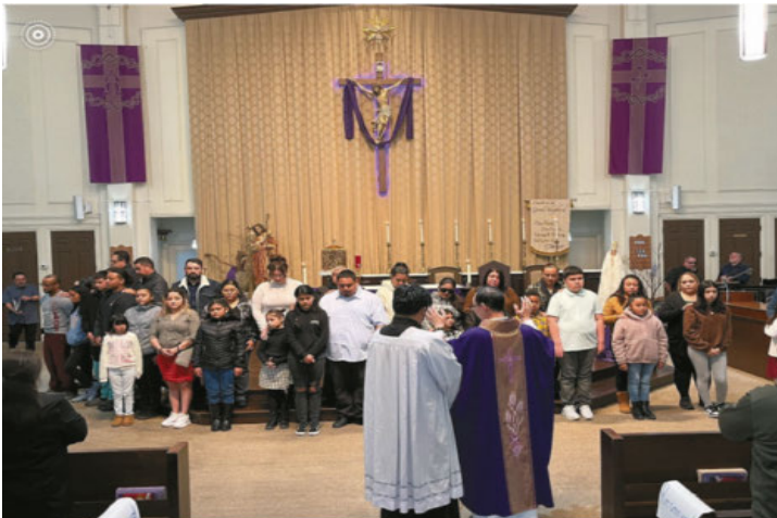
First Scrutiny for RCIA, March 3rd at 10am Mass