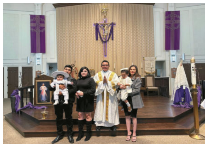
Baptism, March 2, 2024