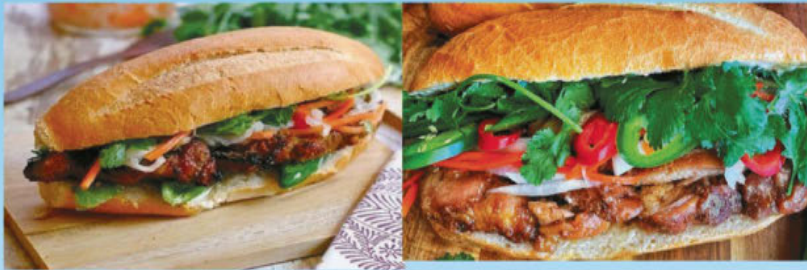
Banh Mi Grilled Pork