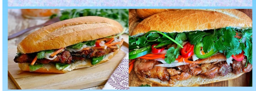
Banh Mi Grilled Pork