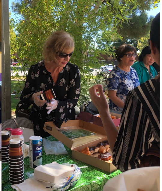
COFFEE & DONUTS AFTER THE MASSES HOSTED BY HOSPITALITY MINISTRY