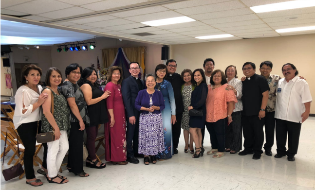
FUNDRAISING DINNER FOR SEMINARIANS ORGANIZED BY CATHOLICS DAUGHTERS