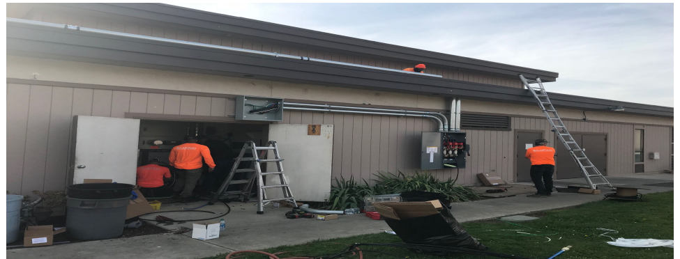
Solar Craft & PG&E working hard to get our solar done by the end of this month.