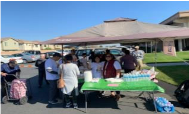
Sons and daughters of St. Padre Pio feeding the hungry...