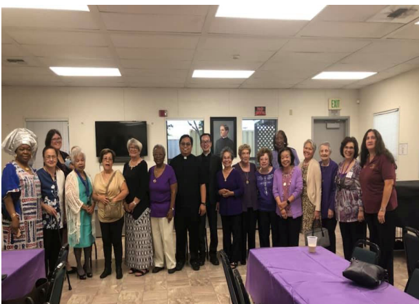
C D A F E L L O W S H I P